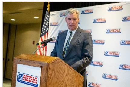
RI's U.S. Senators Jack Reed (L) and Sheldon Whitehouse (R) give remarks at Defense Innovations Days